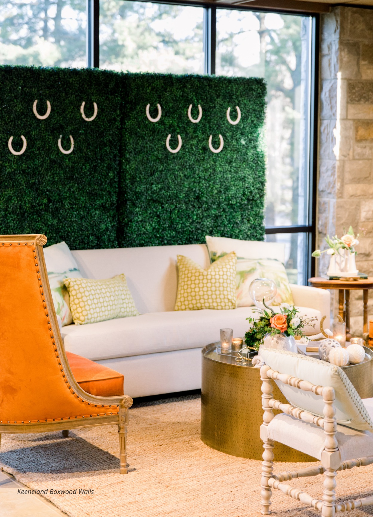
Keeneland Boxwood Walls